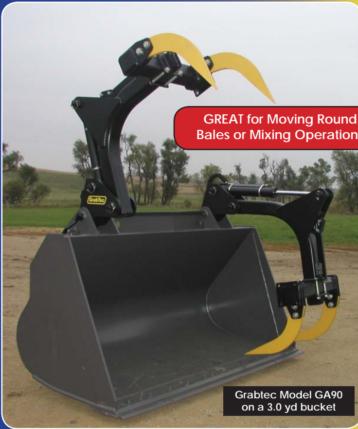
Grabtec Model GA90 on a 3.0 yd bucket

GREAT for Moving Round Bales or Mixing Operations