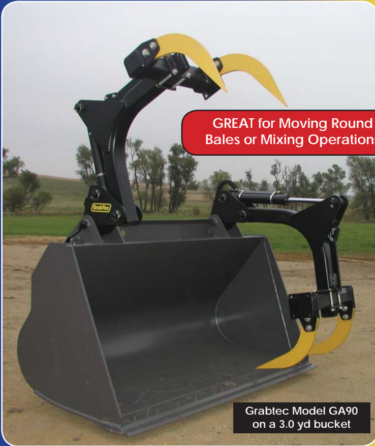
Grabtec Model GA90 on a 3.0 yd bucket

GREAT for Moving Round Bales or Mixing Operations